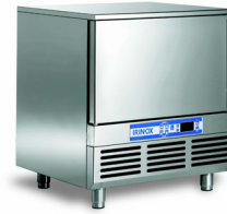
Model EF 20.1

The IRINOX Model EF 20.1 Blast Chiller / Shock Freezer shall have the following characteristics: Capacity – (8) 18"x13" half size sheet pans or (4) 12"x20"x2-1/2" steam table pans or (6) gelato pans. Controller shall feature four (4) standard modes for chilling or freezing. Core probe – product core temperature probe with "easy-out" feature; plus all the standard features listed below.