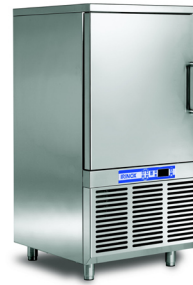
Model EF 30.1

The IRINOX Model EF 30.1 Blast Chiller / Shock Freezer shall have the following characteristics: Capacity – (16) 18"x13" half size sheet pans or (8) 12"x20"x2-1/2" steam table pans or (12) gelato pans. Controller shall feature four (4) standard modes for chilling or freezing. Core probe – product core temperature probe with "easy-out" feature; plus all the standard features listed below.