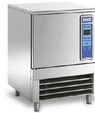
Model MF 25.1