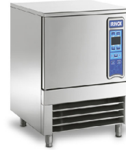
Model MF 30.2