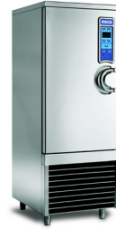
Model MF 70.1L